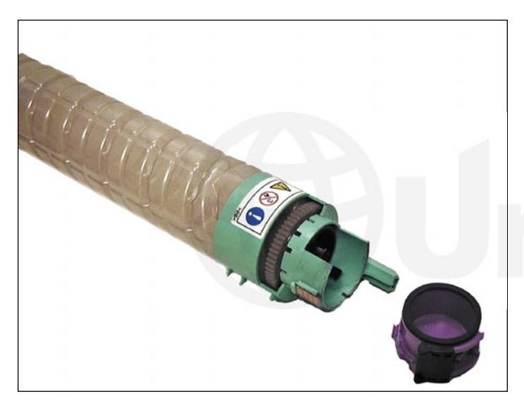
1. Carefully pry off the colored end cap from the end of the tube.

The Type 145 cartridges are rated for 15,000 pages at 5% coverage. The OEM numbers are 8888308 Black, 8888311 Cyan, 8888310 Magenta, and 8888309 Yellow. There is a chip that needs to be replaced each cycle.