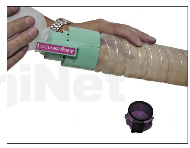
2. Vacuum out all the old toner and replace with new.